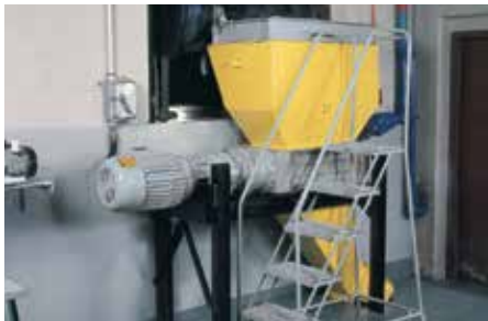
4-SHRED-H with Custom Hopper and Discharge Chute

Note: Actual Thru-put depends on drive selection and type of material to be Shredded. Consult factory for final analysis of application.