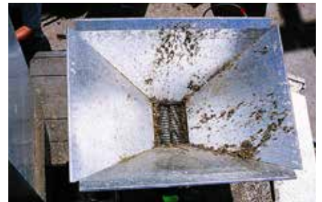
Customized Hopper Variations