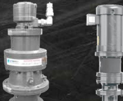
Optional Hydraulic Motors with or without a hydraulic power pack.