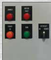
Model PC2200 Standard Enclosure