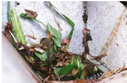
Shredding Food Waste